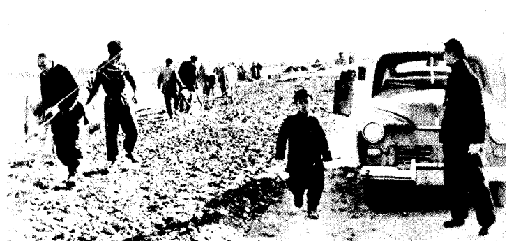
Here you see the primitive methods being employed by Red Chinese workmen as they resurface a road 70 miles from Peiping.